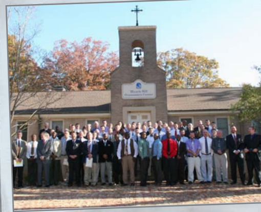
Overcomers Center Dedication Ceremony