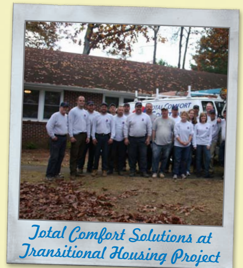
Total Comfort Solutions at Transitional Housing Project

For the Overcomer's transitional house renovations, God provided