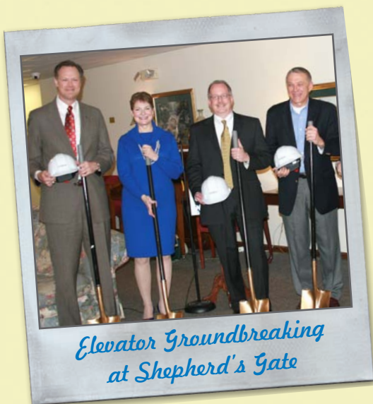
Elevator Groundbreaking at Shepherd's Gate

The Miracle Hill endowment has grown to over $6.5 million. Several gift annuities and proceeds received from a life insurance policy contributed to this growth. The donors who made these planned gifts saw the importance of not only meeting current needs but also building savings for the future.